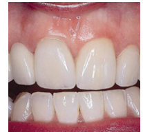
All-Ceramic after 7 years