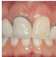
Metal Ceramic after 7 years

Sometimes called ‘caps’ are used to restore a single tooth. They are used by a dentist when a tooth has had large fillings, extensive cavities, damage, or simply for aesthetic purposes. Esthetimax all-ceramic crowns can be cemented into place on your front and pre molar teeth. They act to protect your underlying natural tooth tissue, and because of their all-ceramic nature, are biocompatible with the surrounding gum tissue. Additionally, unlike restorations with metal based substructures, Esthetimax crowns will not develop dark lines around your gum tissue with time.